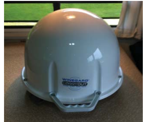
WINEGARD SATELLITE DISH

There is an old saying that "every now and then even a blind dog finds a bone." I don't have much luck with electronics, but as it turned out this day was going to be the exception. After carefully